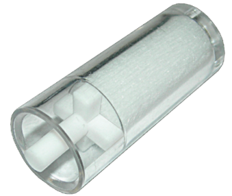
Oil Tester Item Number: 45346